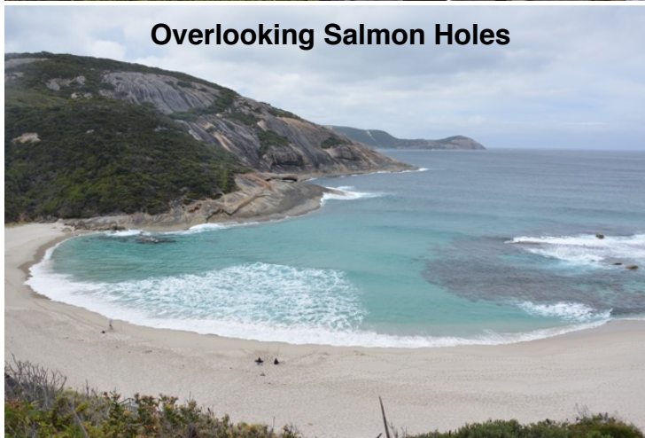
Overlooking Salmon Holes