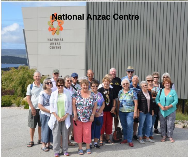
National Anzac Centre