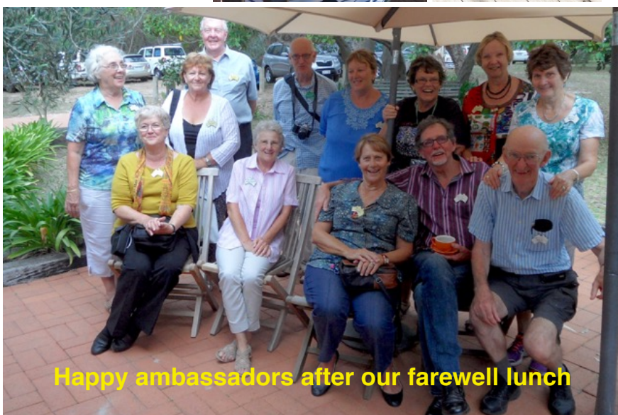
Happy ambassadors after our farewell lunch