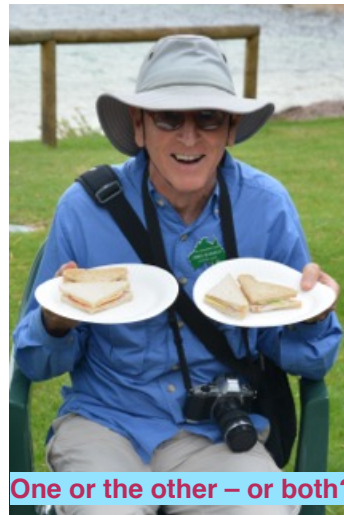
One or the other – or both?