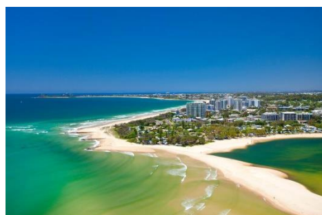
Cotton Tree Caravan Park (foreground)

Accommodation. There is a vast amount of accommodation within close proximity to the Conference Venue. Suggested areas are Maroochydore and Cotton Tree (walking distance). Alexandra Headland and Mooloolaba are only a very short drive away. Some Suggestions are:- All within short walking distance to RSL Conference venue Aqua Vista 07 5430 3600 www.aquavistaresort.com.au 62 Sixth Ave Maroochydore 2 bed apt sleeps 5 Horton Apts. 07 5430 9600 www.hortonresort.com 1 Mungar St Maroochydore 1&2 bed apts. Maroochydore Beach Motel 07 5443 7355 www.maroochydorebeachmotel.com 18 units Top Spot Motel 07 5443 1245 www.topspotmotel.com.au 16 Units Duporth Riverside 07 5450 3777 www.theduporth.com.au 6Wharf St Maroochydore There is a caravan park at Cotton Tree and another at Maroochydore both only a short distance from the Conference Venue Check out this web site if you are travelling by car and are willing to travel short distances. Mooloolaba and Alexandra Headland are very close and have abundant accommodation. https://www.google.com.au/#q=Sunshine+coast+accommodation