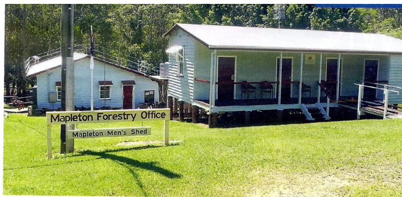
Mapleton Men's Shed with new roofing on the workshop and barracks