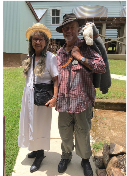
Oz Day 2018 at Mapleton