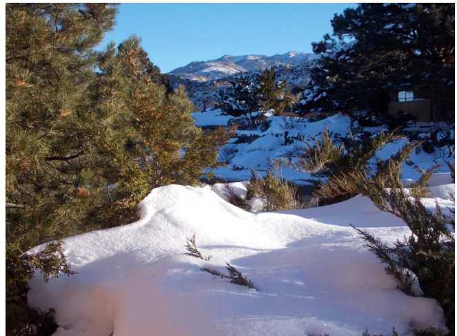
Albuquerque in January