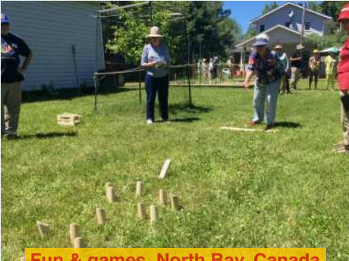
Fun & games, North Bay, Canada