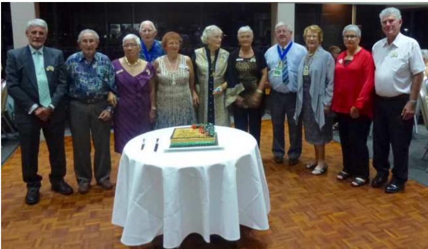
Taken at the 25th anniversary dinner, this photo shows 11 presidents or former presidents of FFSC.