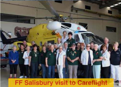
FF Salisbury visit to Careflight