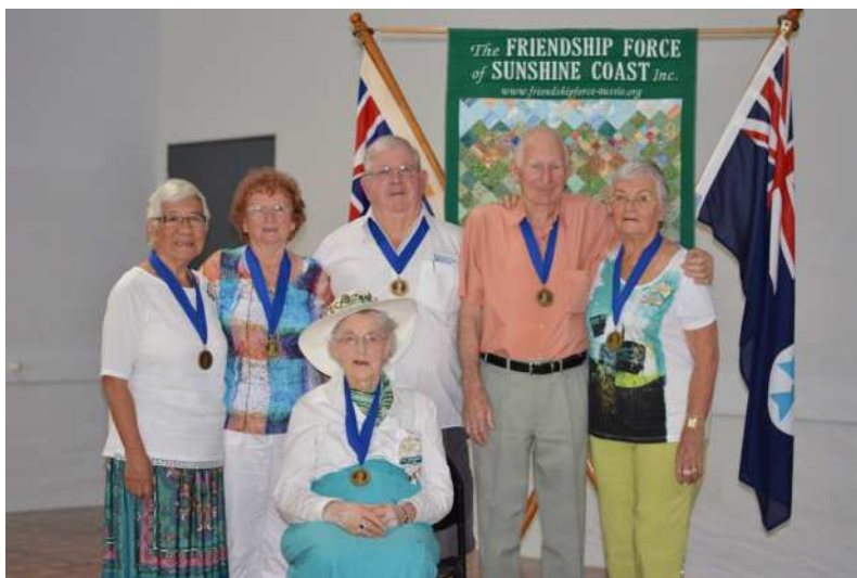
Wayne Smith medal recipients – 30 Nov 2014