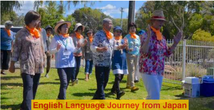
English Language Journey from Japan