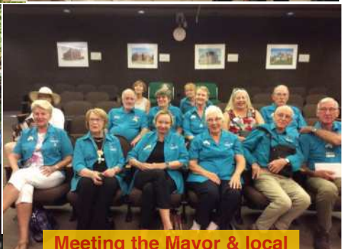
Meeting the Mayor & local MP, North Bay, Canada